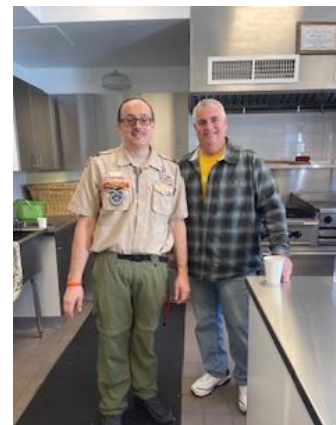
IN CHARGE OF THE KITCHEN