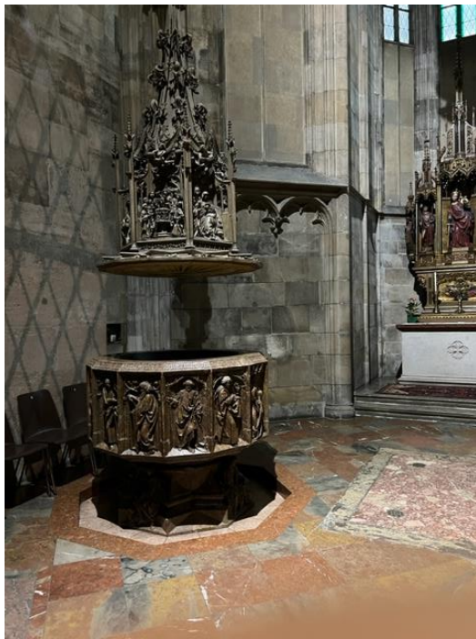
ST STEPHENS'S – BAPTIST, CENTRAL TO THE CHURCH, YET IN A CORNER