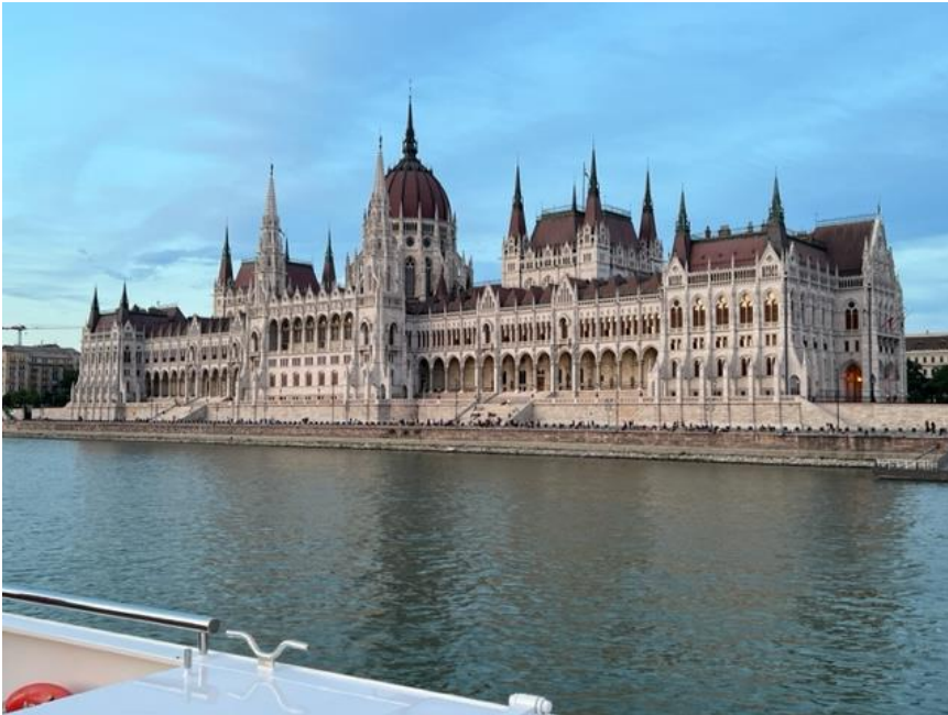
PARLIAMENT HOUSE, BUDAPEST